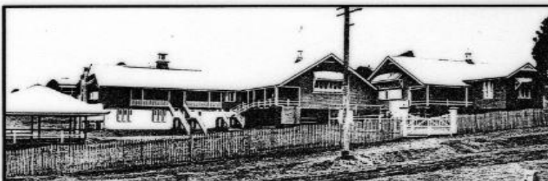
Nambour State School c.1917 in (Mill St) now Bury Street